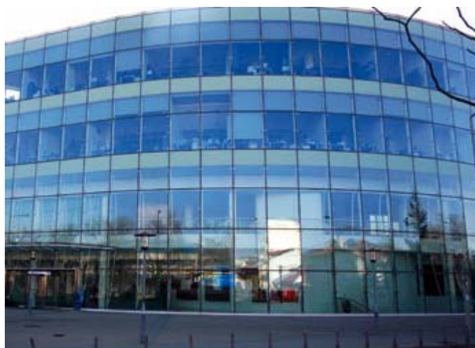
Venue: Auditorium of the Research Centre, Prilaz baruna Filipovića 25, Zagreb

Vončinina 2/1, 10000 ZAGREB ID-HR-AB-01-080416772; IATA 75-3 2121 2 Tel. +385 1 461 65 98; 466 37 52 Fax. +385 1 466 37 52 E-mail: tiptours@tiptours.hr