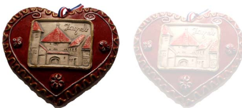
Licitar Heart from Zagreb

Conference's token: The licitar heart, originally named Licitarsko Srce, an age-old Croatian traditional product, is a uniquely decorated cake made of honey-dough and is the symbol of love in Croatia. The humble licitar heart opens the door to one's heart, softens the soul and brings emotions to the surface. The warmth and affection that such a gift shows to our friends make them even more supportive and caring. And finally, these hearts convert the cry of our ancestors into happiness for keeping their memory alive.